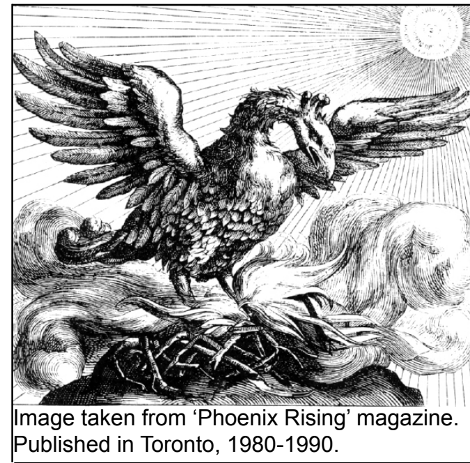
Image taken from 'Phoenix Rising' magazine. Published in Toronto, 1980-1990.