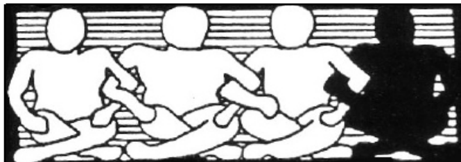
Graphic from cover of Shrink Resistant: The Struggle Against Psychiatry in Canada , Published 1988.

Plans are under way to create an archives exclusively devoted for just this purpose. Much of our history has too often been ignored or trivialized by mainstream historians. Our history is far too important to be left up to academic historians alone! It is essential that an alternative, psychiatric survivor operated archives be established to build on the past by preserving our rich history for the future.