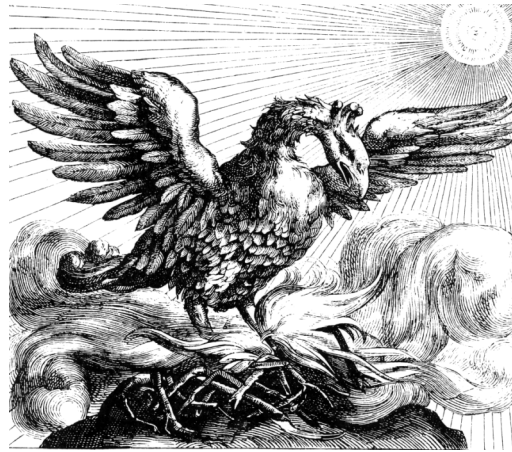
Image taken from 'Phoenix Rising' magazine. Published in Toronto, 1980-1990.