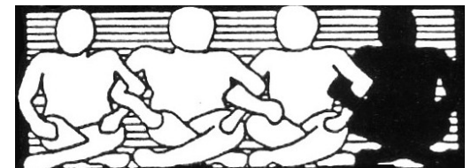
Graphic from cover of Shrink Resistant: The Struggle Against Psychiatry in Canada, Published 1988.

That is a lot of history for people who aren't supposed to have any! There is plenty more history like this if we look for it and preserve it. Plans are under way to create an archives exclusively devoted for just this purpose. Much of our history has too often been ignored or trivialized by mainstream historians. Our history is far too important to be left up to academic historians alone! It is essential that an alternative, psychiatric survivor operated archives be established to build on the past by preserving our rich history for the future.